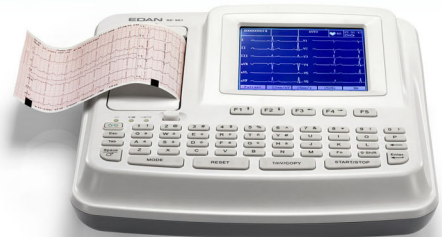
SE-601B Vivid waveform display on large screen (5.7 inch STN LCD) 100 ECGs in internal memory