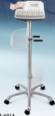
SE-601A 50 ECGs in internal memory