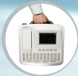
Portable and compact design