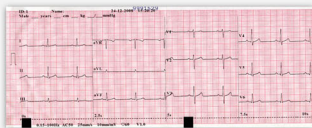
12 lead ECG waveform Rich print formats to meet different needs