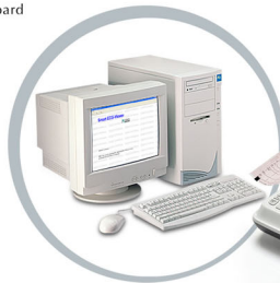
PC-based data management software Smart ECG Viewer offer the perfect data management solution