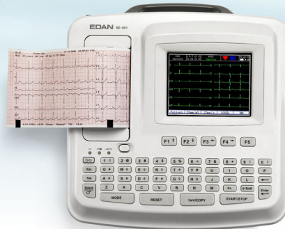
SE-601C Large backlight color screen (5.7 inch TFT LCD ) 200 ECGs in internal memory